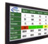
Large Screen Displays